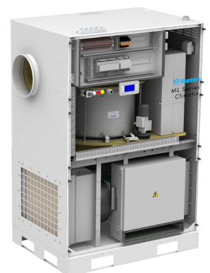
ML with Climatix Controls