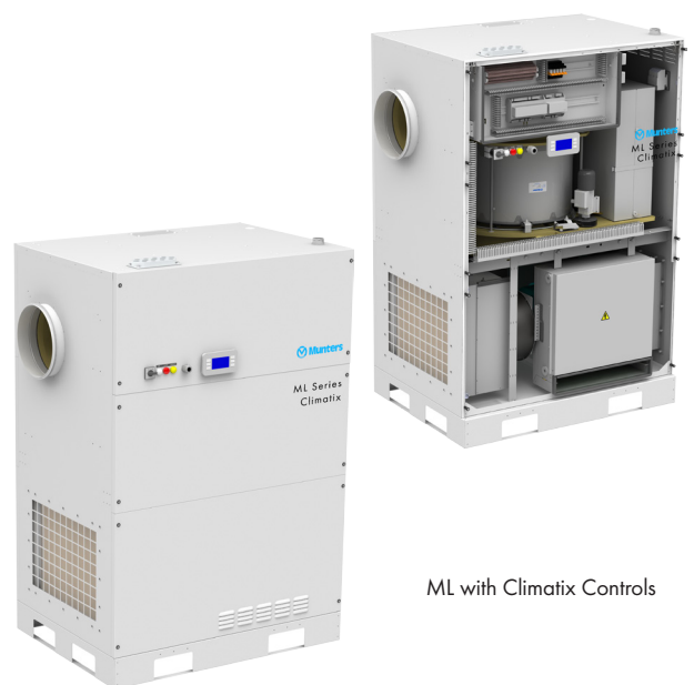
ML with Climatix Controls

ML Series dehumidifiers conform to both harmonised European Standards and to CE marking specifications.